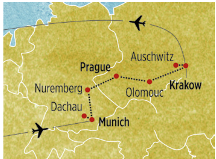
This is a preliminary itinerary for your group.